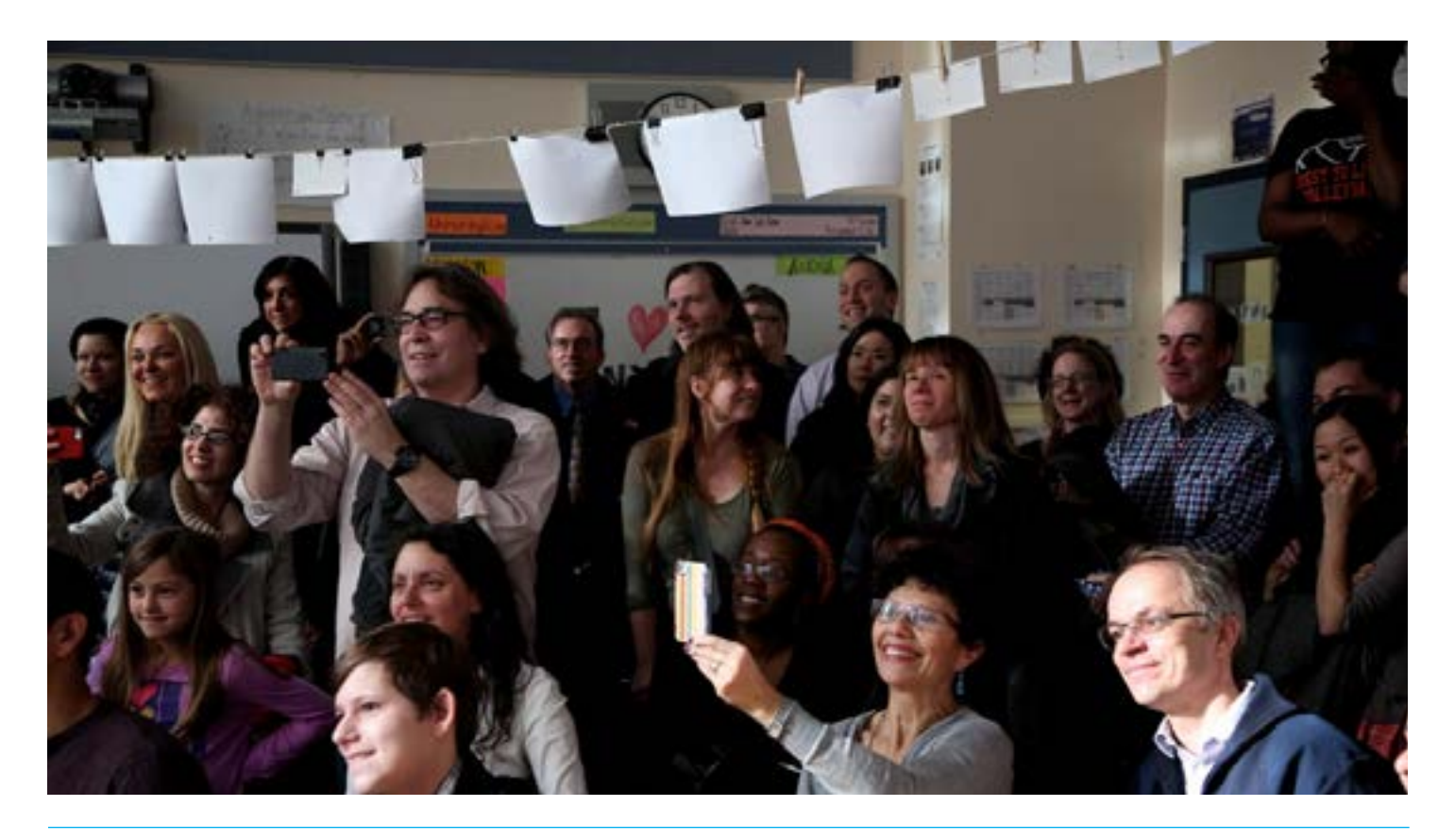
The audience at the discovery mission's public exhibition listens to a student's monologue.

For the final assessment, students go through final rounds of revision and refinement of their podcasts created for TeenInk. Then they submit their personal narratives (previously revised and refined) and podcasts to TeenInk.