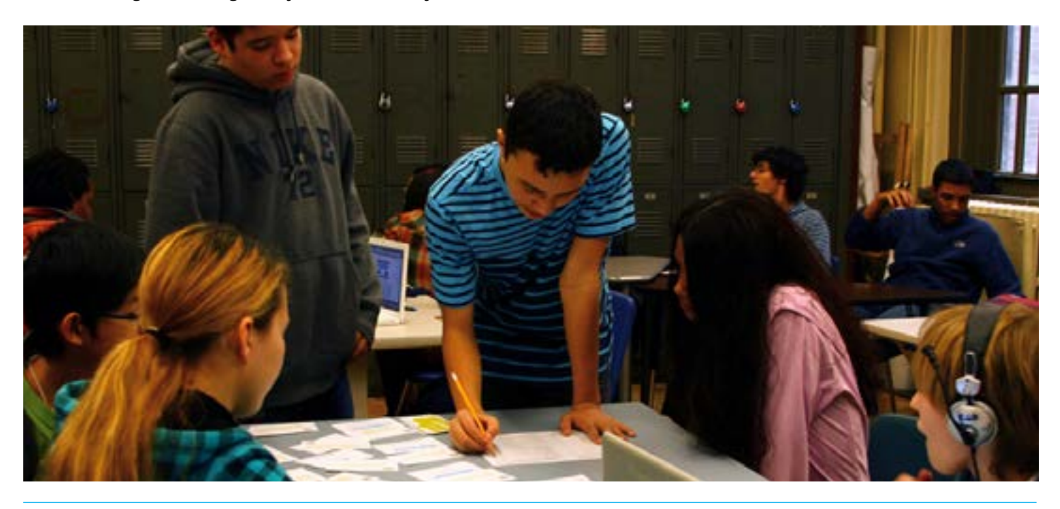
Students play a round of Say, Hear, See with excerpts of To Kill a Mockingbird.

This section provides more detailed information about each problem set to help you develop and design your own version of this discovery mission for your students. Within each problem set, we describe its game-like learning experiences and list the types of assessments produced by students as evidence of their learning. Note that all games designed by Institute of Play are italicized.