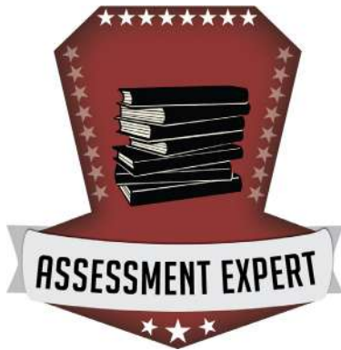
Figure 2. The image file, or PNG file, is the outward facing graphic interface of the badge.